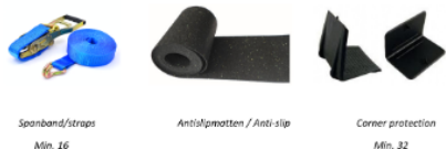
Spanband/straps Min. 16

Minimaal benodigde ladingsekeringsmiddelen / Minimum load securing requirements: